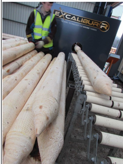
Excalibur Incising machine for round timber - Image courtesy of Arch Timber Protection -a member of the UK Timber Decking and Cladding Association