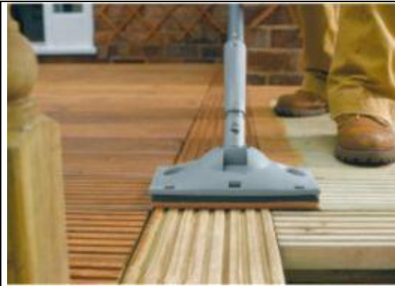
Decking image from last month's newsletter