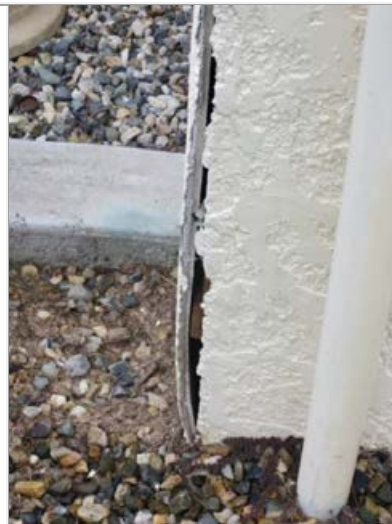
Damage to walls from expanding timber - Image courtesy of Colin Mackenzie