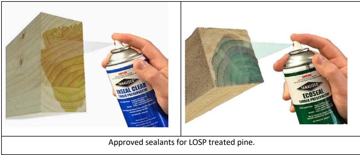
Approved sealants for LOSP treated pine.

If I had to hazard a guess as to what happened in the handrail in the opening images I would say that the ends weren't sealed with a preservative rather simply just cut to length, Alternatively, the ends may have been painted which you can do with hardwood, but with pine, the moisture that is trapped inside almost guarantees decay. My preference between the two sealants from Arch Wood Protection above is Ecoseal as, with its green colour, you can inspect and confirm that the end has been sealed. So, when specifying pine, handrail ensure you have a note about sealing the end of the handrail and note the required sealant otherwise it will be ignored or simply get painted.